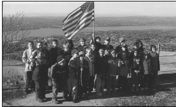
Mt. Beacon Incline Society and Cub Scout Pack 54 of Fishkill Hike Mt. Beacon.