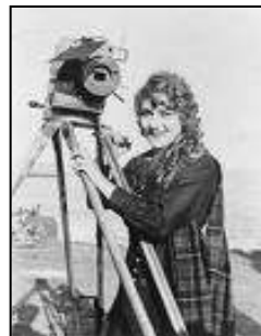
Top left photo: D.W. Griffith's The Fugitive . Right photo: Mary Pickford behind the camera.

The Mount Beacon Incline Society is planning on having a "Movie Night" early in 2008 in which the above movies will be shown. The event will be advertised and proves to be a very interesting and entertaining night.