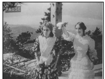
Actresses on top of Mt. Beacon filming a D.W. Griffin film.

In the movie the burros are teamed with the bad white men who harass and drive the Indians from their lands.