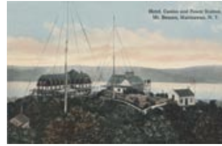
Beaconcrest Hotel, "Casino" and Incline Railway Wheel House